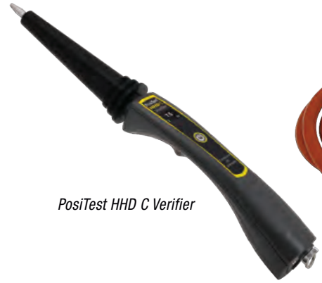
PosiTest HHD C Verifier