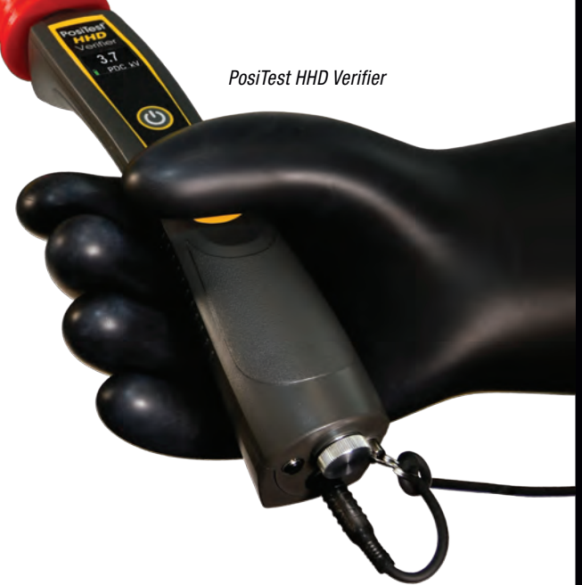
PosiTest HHD Verifier