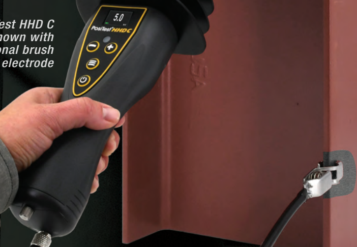
PosiTest HHD C shown with optional brush electrode