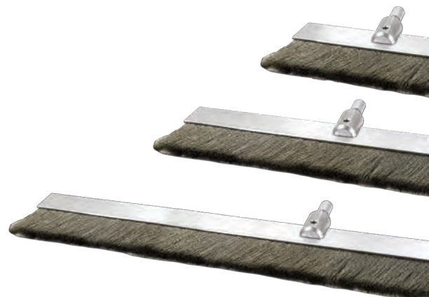
Flat Wire Brush Electrodes

Use spring and brush electrodes made by other manufacturers with DeFelsko adaptors: