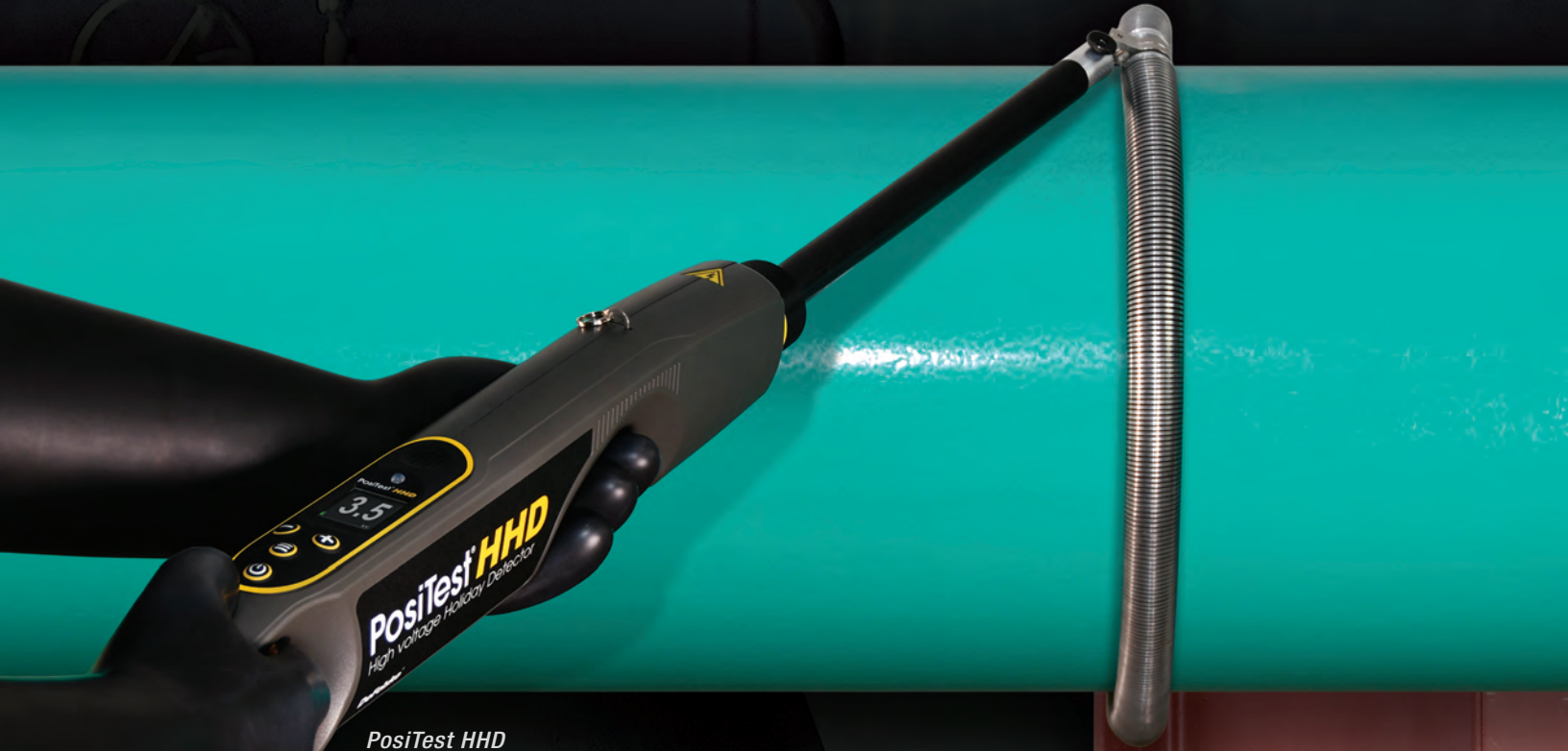
PosiTest HHD shown with optional spring electrode

Detect holidays, porosity, pinholes, leaks, and other discontinuities