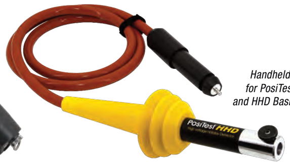
Handheld Wand for PosiTest HHD and HHD Basic only